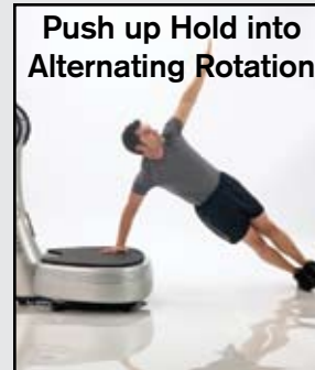
Push up Hold into Alternating Rotation