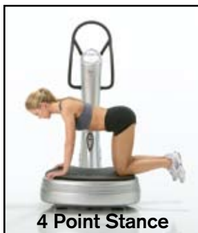
4 Point Stance

Sets/Duration 2 x 45 seconds Frequency/Amplitude 30-40 Hz/Low Rest 45 sec between sets Execution Static