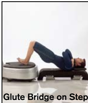
Glute Bridge on Step

Sets/Duration 2 x 45 seconds Frequency/Amplitude 30-40 Hz/Low Rest 45 sec between sets Execution Static