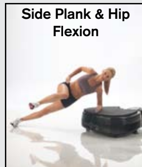
Side Plank & Hip Flexion