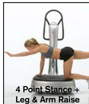
4 Point Stance + Leg & Arm Raise