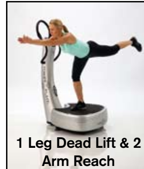
1 Leg Dead Lift & 2 Arm Reach