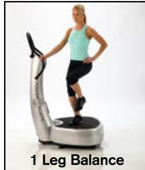
1 Leg Balance

Sets/Duration 2 x 30 seconds Frequency/Amplitude 30 Hz/Low Execution Static or Static Variable