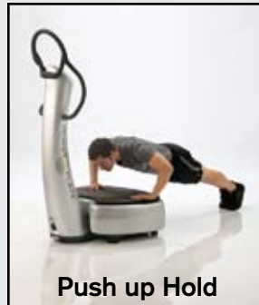
Push up Hold

Sets/Duration 2 x 30 seconds Frequency/Amplitude 30 Hz/Low Execution Static or Dynamic